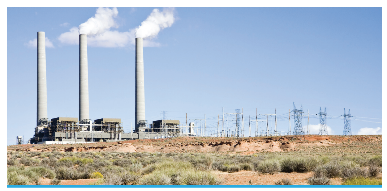
The Navajo Generating Station coal plant, near Page, Arizona, is being decommissioned in part due to EDF's advocacy.

In the beginning, there was so much work, it was all new. It was so highimpact. It was a wonderful opportunity for me as a young attorney to grow and learn. It probably wasn't so good for the country to have someone so inexperienced working on these issues!