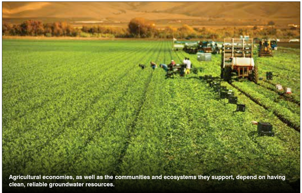
Agricultural economies, as well as the communities and ecosystems they support, depend on having clean, reliable groundwater resources.

In addition to broad community involvement from the early stages of planning, there are specific things that water managers can do to build trust. Using data to illustrate current groundwater conditions and simulate future impacts can lend credibility to water managers, as well as create a sense of ownership in the future of the program. Water managers in the Kings Basin in California, for example, used data-driven groundwater models to convey how