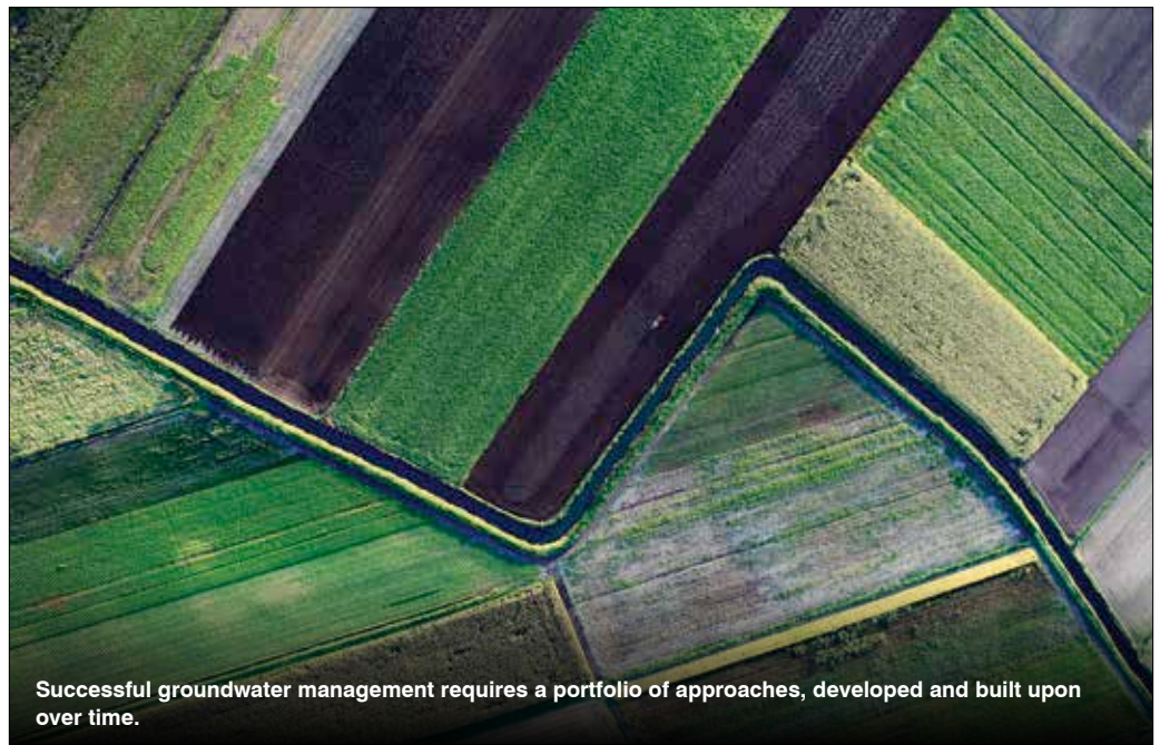
Successful groundwater management requires a portfolio of approaches, developed and built upon over time.

The case studies demonstrate the importance of sufficient monitoring networks and enforcement protocols. Any policy is only as good as the monitoring and enforcement behind it. Without adequate monitoring to detect noncompliance followed by subsequent enforcement measures, there will often be an inclination to ignore regulatory requirements. Monitoring and enforcement are an underappreciated aspect of groundwater management that incurs monetary, social, and political costs. This is especially true in areas where groundwater managers live and work alongside the very people whose actions they must manage. For this reason, it is critical to have political and community support, as well as sufficient financial and